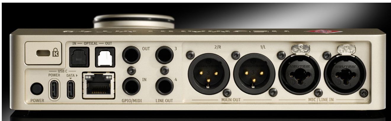
At the back we find a pair of USB-C ports, an RJ45 Ethernet connector, optical I/O ports, 'general purpose' quarter-inch I/O for footswitches or MIDI, a pair of quarter-inch line outputs, a pair of XLR main outputs, and pair of XLR/jack inputs.