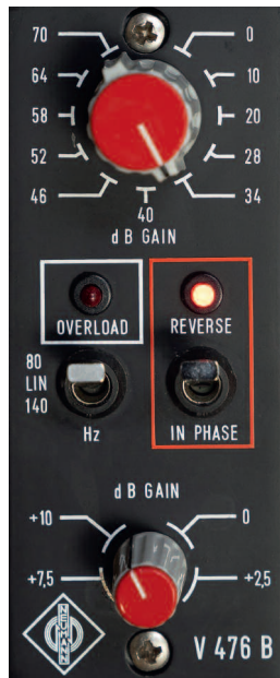
Ancestor: The V 476 B preamplifier module of the 1980s represents the state of the art at that time. Today it is popular for its subtly colored character.

Let's move on to the monitoring section. Generally speaking, I like the idea of integrating a headphone output into a preamp. I've used a Universal Audio DCS Remote Preamp for many years for recording and microphone testing purposes because it allows latency-free headphone monitoring. In terms of sound, the V 402 is superior to the DCS, both in terms of the preamp section and the quality of the headphone amplifier. However, the V 402 lacks a cue input to feed the DAW signal. That's unfortunate especially when recording overdubs because, obviously, you need to be able to listen to the already recorded tracks for orientation. In the case of mono overdubs, a possible workaround is to feed the DAW signal (in mono) into the V 402's second channel. The two level controls in the