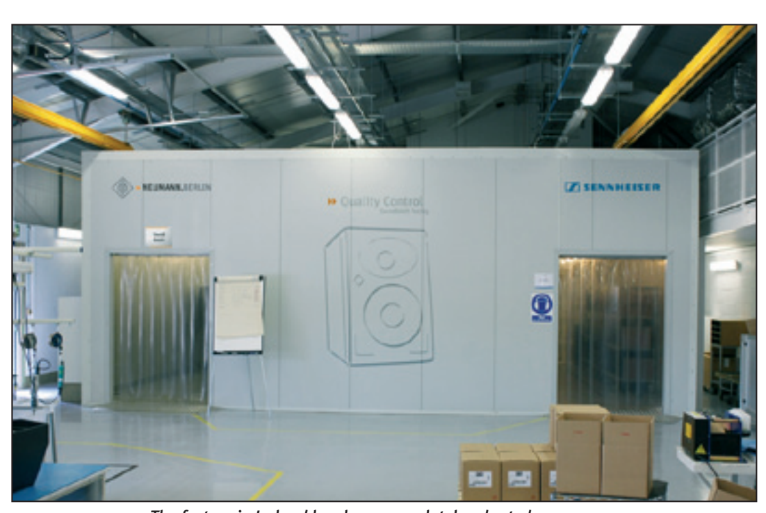
The factory in Ireland has been completely adopted to the new conditions and requirements

ly operating limiters are incorporated; these are in the signal path only when the limiters begin to work. In addition, there is integrated protection against thermal overload. If such overload occurs, the Neumann logo signal light, which is white during normal operation, becomes red. The amplifier module installed in the metal cabinet benefits from the good thermal conductivity of the heat sink and the cabinet. Moreover, the non-parallel walls of the KH 120 greatly attenuate internal standing waves in the cabinet. For practical applications, the large selection of mounting accessories is certainly important, particularly when exact positioning is required in confined working conditions, for instance in an outside broadcast van.