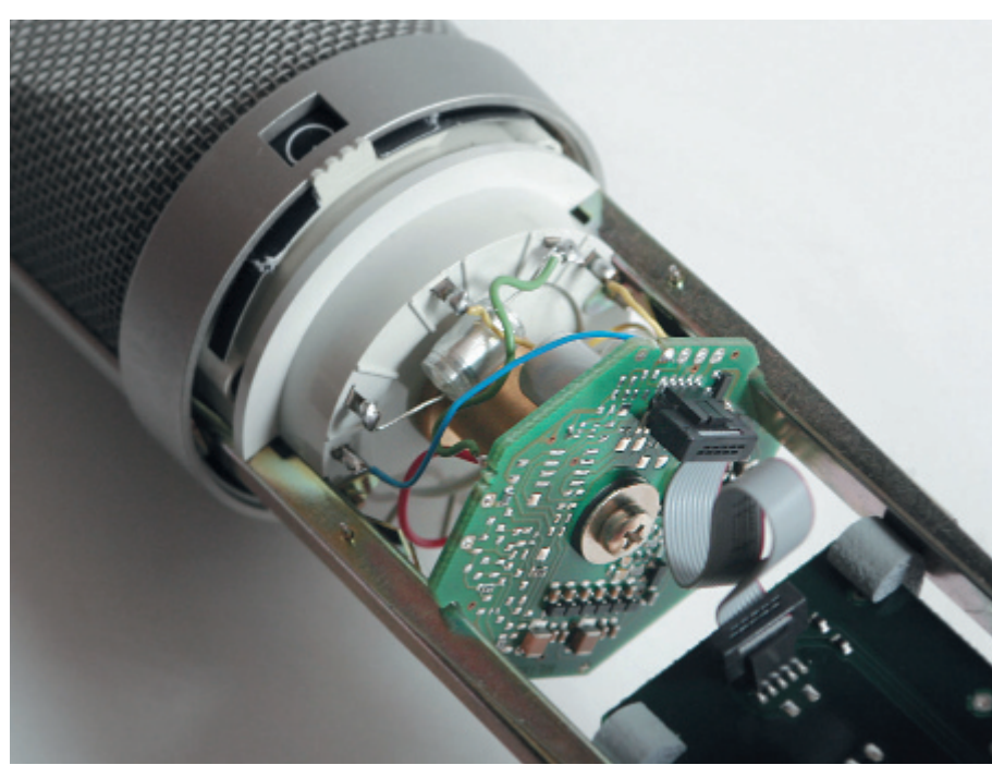
The backside of the circuit board holds a modern CMOS DC/DC converter. Shown above: A fat polystyrene capacitor – just like in the good old days

miliar diamond shaped company logo adorns its front. However, in keeping with the anniversary, there is an additional gleaming bronze-colored commemorative badge depicting the company's founder Georg Neumann. This visual design, by the way, is to be retained beyond the anniversary year.