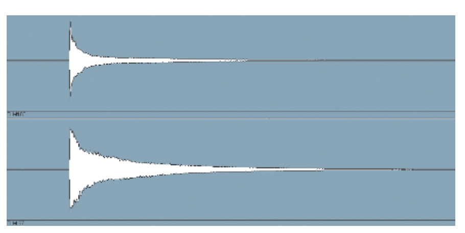
Simultaneous recordings of a triangle with matched peak levels: The TLM 67 appears considerably louder than the TLM 103.